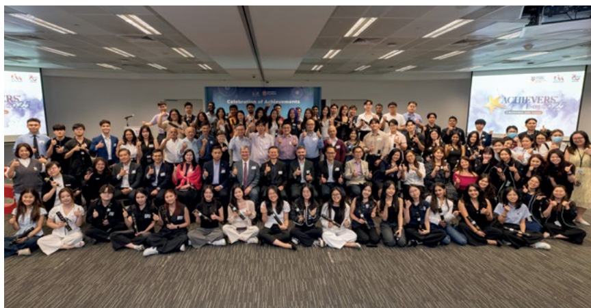
In 2025, the University of London awarded SIM students with 17 academic achievement awards, 54 commendations, and 26 were also recognised for topping the world in their modules.

In recognition of this longstanding collaboration, SIM has been awarded the University of London International Partner status in 2025, affirming its commitment to providing education in Singapore for 40 years since 1986.