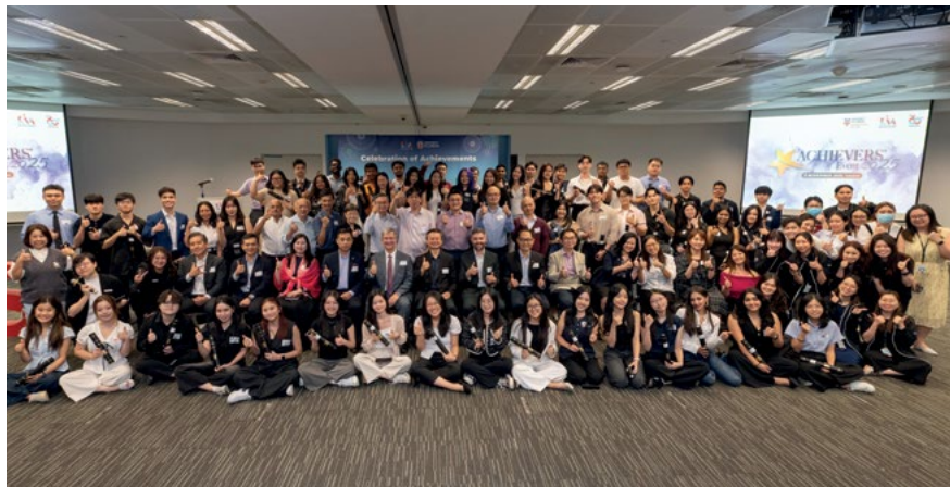
In 2025, the University of London awarded SIM students with 17 academic achievement awards, 54 commendations, and 26 were also recognised for topping the world in their modules.

In recognition of this longstanding collaboration, SIM has been awarded the University of London International Partner status in 2025, affirming its commitment to providing education in Singapore for 40 years since 1986.