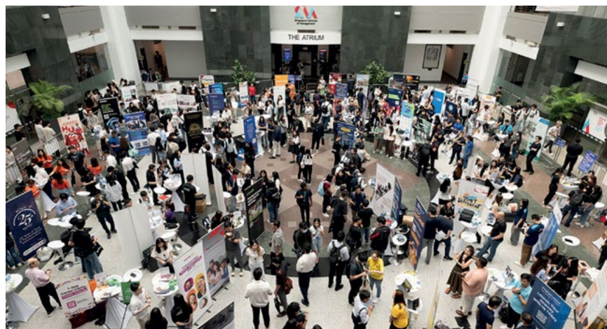
On 3 October 2025, SIM hosted the IGNITE Career & Internship Fair, providing students with the opportunity to connect with top companies from diverse industries for career and internship prospects.